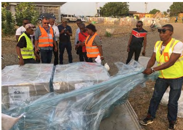
SNEC logistic advisor together with NEC, party agents and security agent receiving ballot papers for the presidential run-off at Lungi Airport, Freetown.

NEC has intensified its voter information strategy for the run-off. More voter information materials such as posters, flyers, voting steps, how to mark the ballot papers, songs and jingles have been developed and distributed across the country.