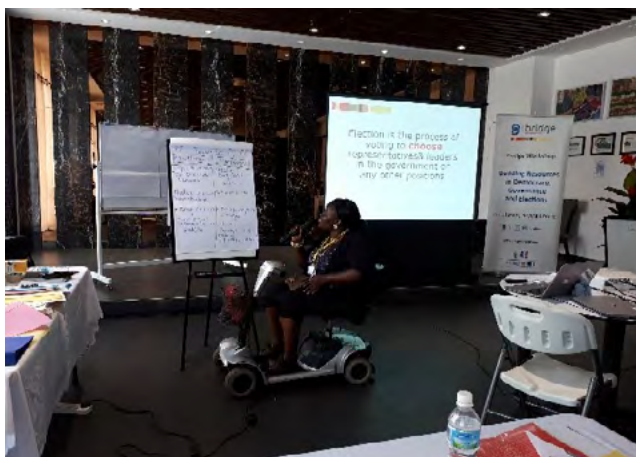
Presentation of group work on the importance of elections.

The following topics were covered: legal framework; international standard-election laws and conventions; electoral cycle, election stakeholders, justice and representation; introduction of electoral systems; majoritarian electoral systems; concepts of voter education, civic education and voter information; introduction to electoral access; what does access mean; access in election phases; developing an access strategy; integrity of elections.