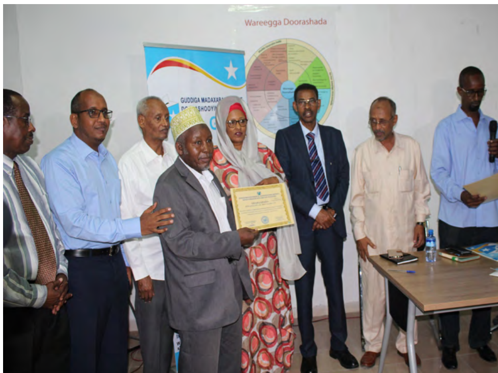
NIEC registration of political parties, 8 April 2018, Mogadishu.

The list with the registered political parties can be found here .