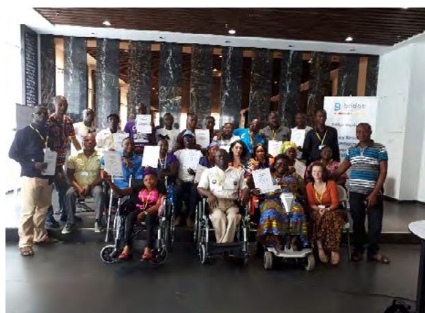
Group photo of participants (AVETOs and DPOs).