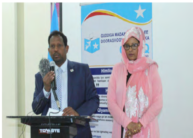
NIEC consultative meeting with CSOs on the development of the voter education curriculum – Mogadishu, 9-10 June 2018.

With this in mind, on 9 and 10 June, the NIEC organised a two-day consultation session with civil society, education institutions, media, youth and women associations, and government agencies on the development and implementation of a voter education curriculum. Prominent participants included the Somali National University (SNU), academy of science, culture and arts as well as ministries of education, women and information.