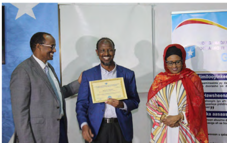
NIEC registration of political parties. Mogadishu, 11 June 2018.

The political party registration is envisaged to be conducted in two phases: temporary certification until general registration of voters, followed by official political party registration based on the submission of the required signatories of 10,000 registered voters, from minimum 9 of the 18 regions that existed before 1991.