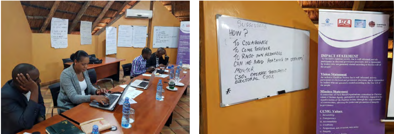
Technical Working Group on the Framework for Domestic Election Observation.

Churches Monitoring Group, for representatives of domestic observer groups and other CSOs to consider options for promoting collaborative, sustainable engagement throughout the electoral cycle. The working session resulted in a draft charter covering structure, internal governance and scope of work for a coordinated framework that will be presented to the wider group of CSOs for feedback.