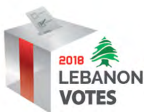
Official logo of the Lebanon 2018 elections

In this reporting period, UNDP LEAP continued its support to the Ministry of Interior and Municipalities (MoIM) in the following areas: