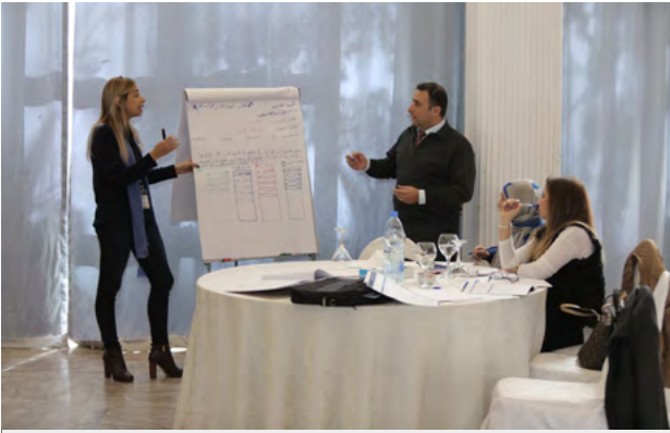
BRIDGE workshop on Elections Management and Operations, 11 December 2017.

management, electoral calendar in 2018, candidates and lists registration, ballot paper design, voting procedures, results management, seat allocation, voting process simulation, elections stakeholders and planning for the electoral event.