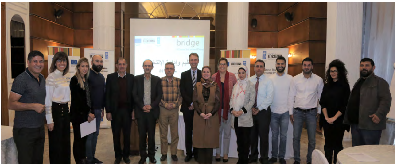
BRIDGE workshop on Elections Management and Operations, 11 December 2017.

enable the registration of candidates in a first phase and the registration of lists of candidates in the second phase.