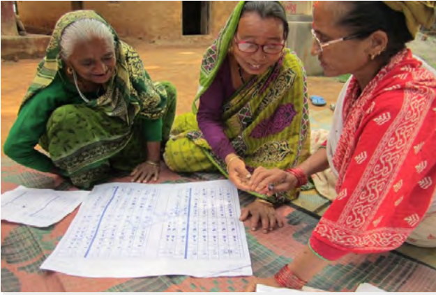
Senior citizens participating in mock polling program.