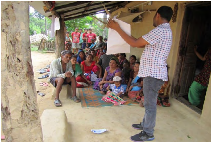
Senior citizens participating in mock polling program.

Along with the voter education programme at field level, the project continued to support the ECN media campaign through technical advice given to the national counterpart while producing voter information PSAs broadcasted on national TV channels and FM radio stations at local level. ESP ensured special efforts targeting people with disability and their inclusion in the electoral process by including specific messages in the PSAs.