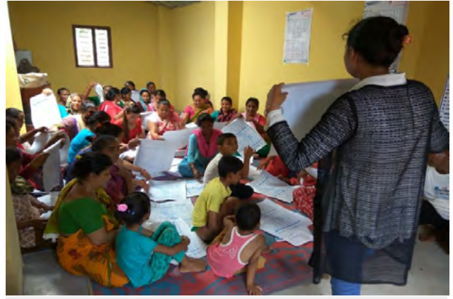
Voter education for the Baadi (Marginalized) Community.