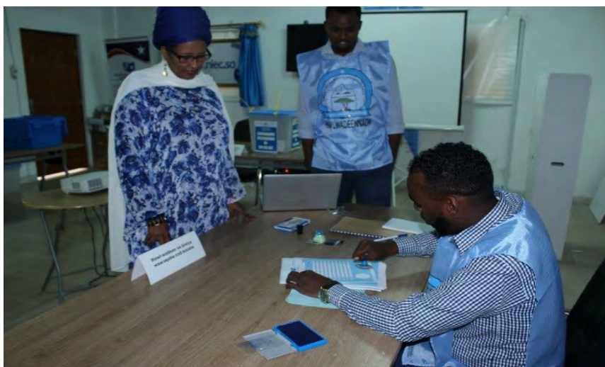
NIEC Chair Halima Ismail Ibrahim overlooking the NIEC's internal simulation exercise of polling and counting, 14 June 2017.

On 12 June 2017, the Federal Minister of Interior, Federal Affairs and Reconciliation (MOIFAR) organized a consultative round-table with national and sub-national actors on the development of the Electoral Law by 2018, a key commitment from the FGS expressed in May at the London Conference on Somalia. As MOIFAR has a lead role to ensure a consultative and inclusive drafting process of the Electoral Law, the main objective of the round-table discussion in June was to get input from the stakeholders and looking for coordination and collaboration to produce a politically agreed electoral system for the 2020/21 universal suffrage. More than 50 participants joined the round-table, of note were participants from the FGS, Federal Member States (FMSs), civil society organizations (CSOs), academia and political association. The UNDP/UNSOM Joint Programme supports the development of the Electoral Law.