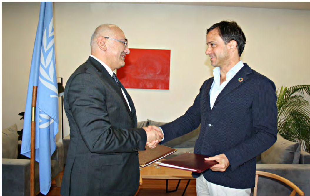
Transfer of the Voter Authentication Devices (VADs), 4 July 2017.

On 4 July 2017, the UN Resident Representative and the CEC Chairman signed the official transfer of property from the UN to the CEC of all voter authentication equipment. The Government of Armenia Focal Point for Elections was also present at the signature and renewed its appreciation for the role played by the UN in the implementation of an “important phase of Armenia’s change of political system” and for the support of the donors, namely the EU, US, UK and Germany.