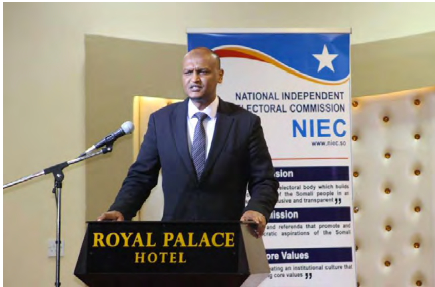
Deputy Prime Minister of Somalia opening the NIEC workshop on voter education. Mogadishu, 29 July 2018.