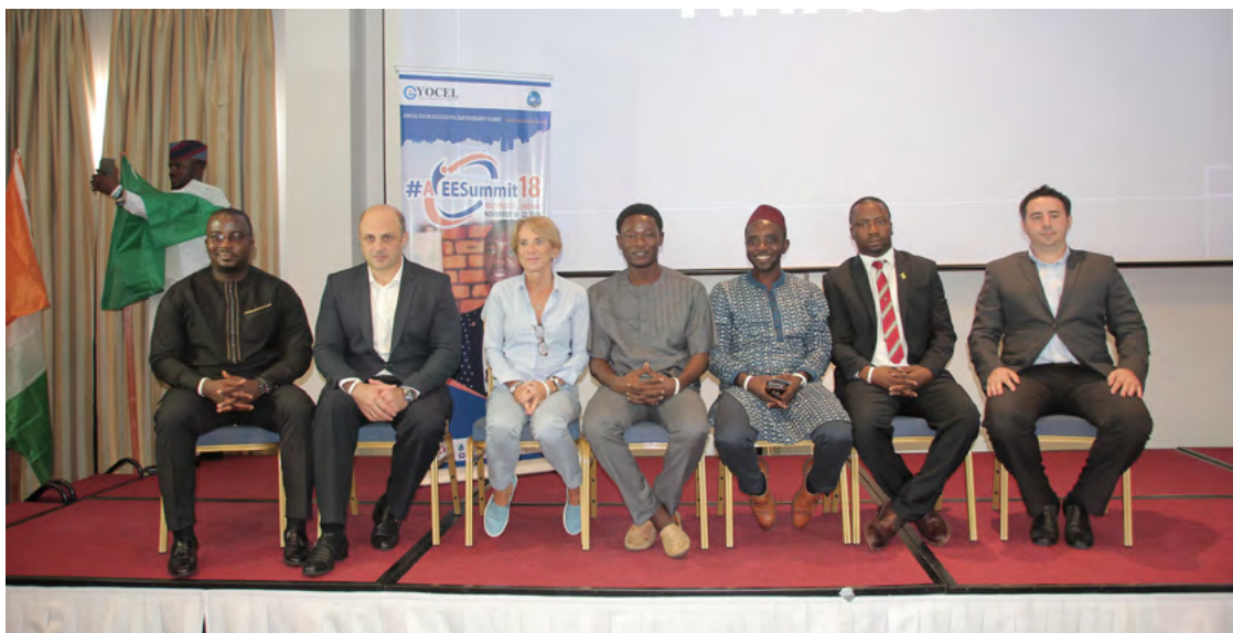
Annual Youth Summit 2018 in Monrovia, Liberia, 18-22 November.

brought together 155 delegates from 12 countries in attendance: Ghana, Ivory Coast, Cameroon, Kenya, Ethiopia, Sudan, U.S.A, Qatar, Sierra Leone, Nigeria, Burkina Faso, Liberia as well as policymakers in government and international organisations, to discuss the challenges youth face with education and empowerment. This intervention resulted in launching of a post-summit engagement platform called Action Plan to follow up on delegates and to measure how they put in use the skills acquired from the summit, how they trained young people in resource mobilisation and in understanding public-private partnership. The Action Plan platform would also expose them to trending topics such as digital marketing and accountability. Finally, a resolution was adopted for engagement of government officials on their commitment to maintain peace and adhere to the recommendations of the 2017 election observer missions.