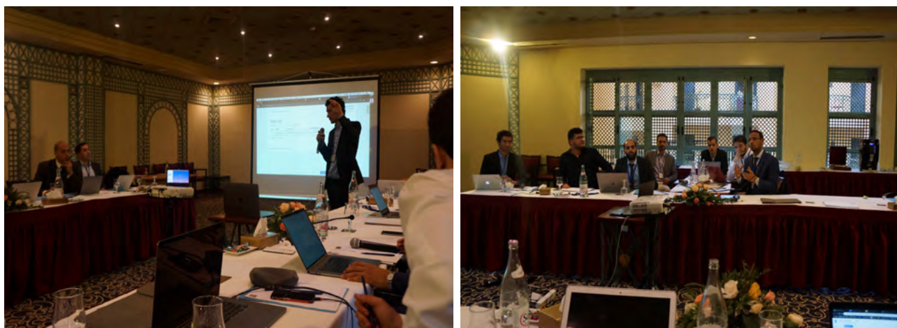
Results management system inception workshop in Tunis.

Capacity building: UNEST and PEPOL supported the HNEC simulation workshop on voting procedures which was held from 25 – 27 November 2018 in Benghazi. About 80 HNEC officials, including a commissioner and some managers, and UNEST members participated in this event which also provided induction to new HNEC staff members from the East and South regions.