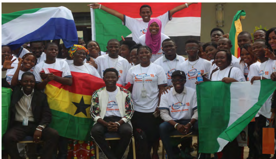
Annual Youth Summit 2018 in Monrovia, Liberia, 18-22 November.

On 18-22 November, the project provided technical and financial support in organisation of the Annual Youth Summit 2018 in Monrovia, Liberia. This is the third consecutive conference organized by Youth Coalition For Education in Liberia (YOCEL) with support of UNDP and the most engaging since its inception in 2016. This Annual Youth Summit