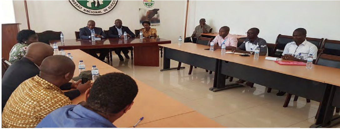
IESU Regional Electoral Advisers meeting with the CNE

GTAPE continued to conduct the voter registration exercise nationwide and in the diaspora. The voter registration exercise is expected to be completed on 5 December. As of 2 December, over 708,609 voters (around 80%) were reported to have been registered, out of an estimated 886,292 eligible voters.