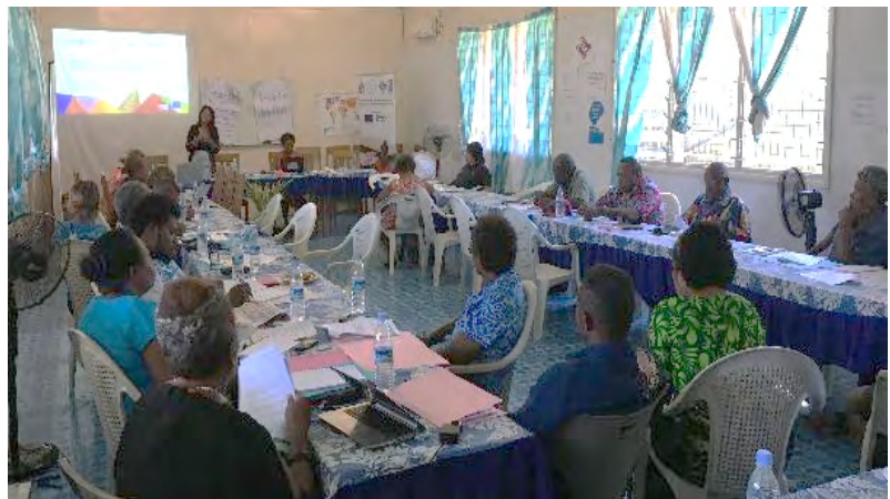
Women candidate school, 25 February - 1 March 2019.

Women candidate schools: A five-day women candidate school commenced on 25 February and will end on 1 March. This first candidate school is attended by women candidates running for the national general election and one male supporter for each candidate. The candidate school aims to provide participants with information and materials they can immediately incorporate into their campaigns to continue building skills and developing practical tools for women candidates. Training modules include design of campaign strategies, fundraising opportunities, communications, canvassing. An average of 15 women candidates for the National General Election and 15 male supporters have regularly participated throughout the one-week training.