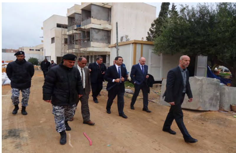
Visit of the EU's Ambassador to the new HNEC Head Office in Sidi Al Masri, on 12 February 2019.

The tender notice for the exterior painting and related items at the HNEC's new compound closed on 17 February 2019 and the evaluation of the 12 received bids is underway.