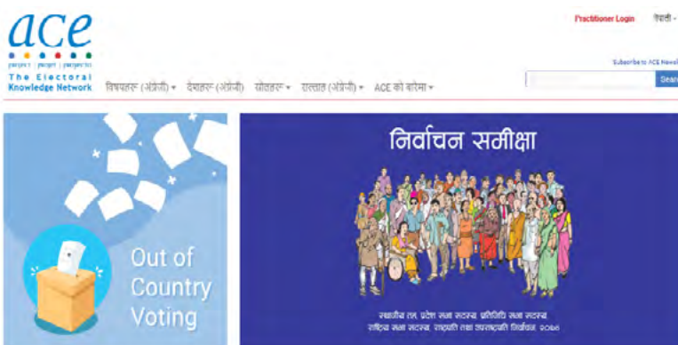
निर्वाचन समीक्षा ज्ञान प्रदान गरेको तीन वर्षे सम्मारे यो वेबसाइट ACE Electoral Knowledge Network से विभिन्न निर्वाचन प्रक्रियाको विवरण तथा र पर्यवेक्षणलाई प्रदर्शन गर्ने निर्वाचन समीक्षा गर्ने उद्देश्यका साथ अत्यन्तै मोडर्न सामग्री सहित बनाइएको छ ।

Screenshot of the Nepali language version of the ACE Electoral Knowledge Network website homepage.