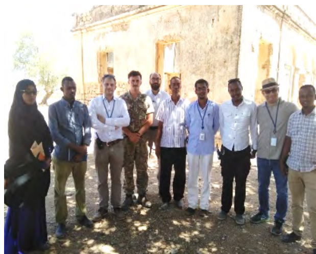
UN/IESG field mission to Baidoa, South West State, to assist the NIEC with the establishment of its field office, 25-25 February, Baidoa.