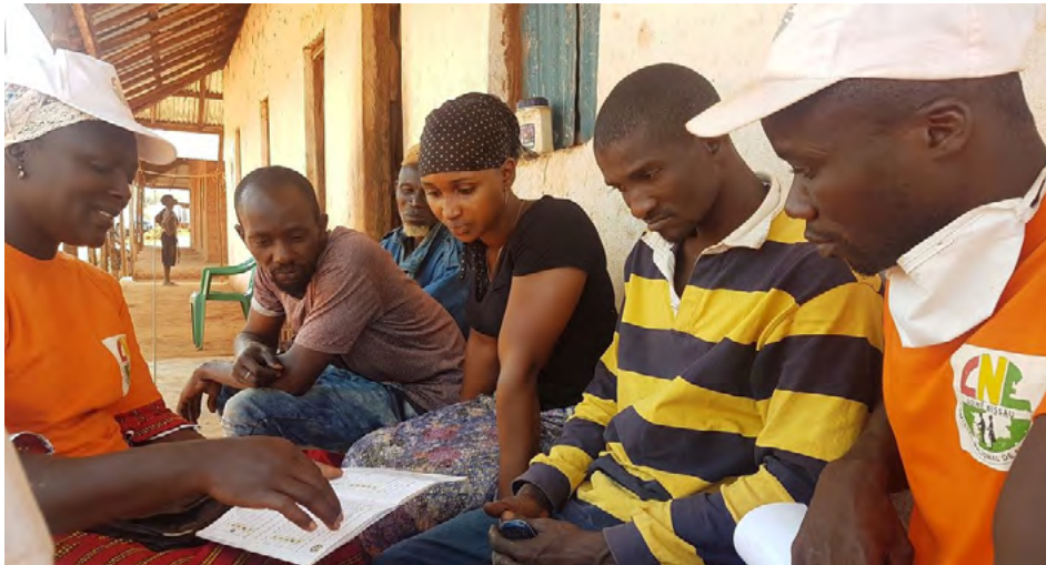
Quinara Civic Animators conducting civic education activities in a village on the outskirts of Catio.

of posters, and refer to the civic animators' handbook to explain people how to vote. They also use the megaphones to call attention and spread the message in larger contexts, such as in markets, streets, etc.