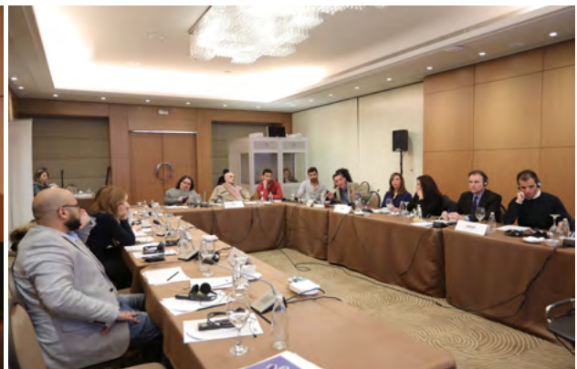
Voter education campaign working groups, 21 February 2019, Beirut.