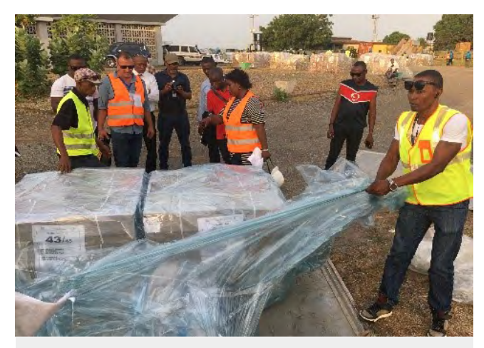
SNEC logistic advisor together with NEC, party agents and security agent receiving ballot papers for the presidentail runoff at Lungi Airport, Freetown.

NEC has intensified its voter information strategy for the run-off. More voter information materials such as posters, flyers, voting steps, how to mark the ballot papers, songs and jingles have been developed and distributed across the country.