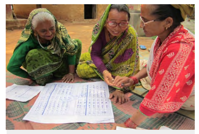
Senior citizens participating in mock polling program.