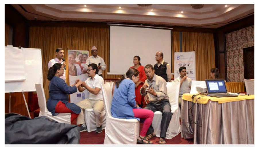
Participants take part in a role-play exercise at the BRIDGE workshop on Disability Rights and Elections.

module The second concerned disability rights and elections. Led by ECN, it targeted disabled people's organisations, political party representatives and media persons. The workshop filled with enriching was discussions on what ECN and political parties can and need to do in order to make the electoral cycle more inclusive for people with disabilities. This workshop also linked with the project's support for the