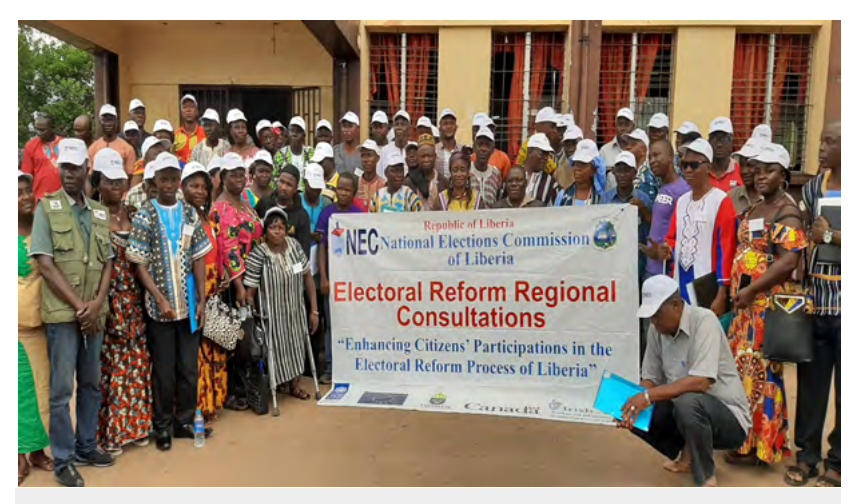
Regional Consultative Workshop held in Gbarnga, Bong County.