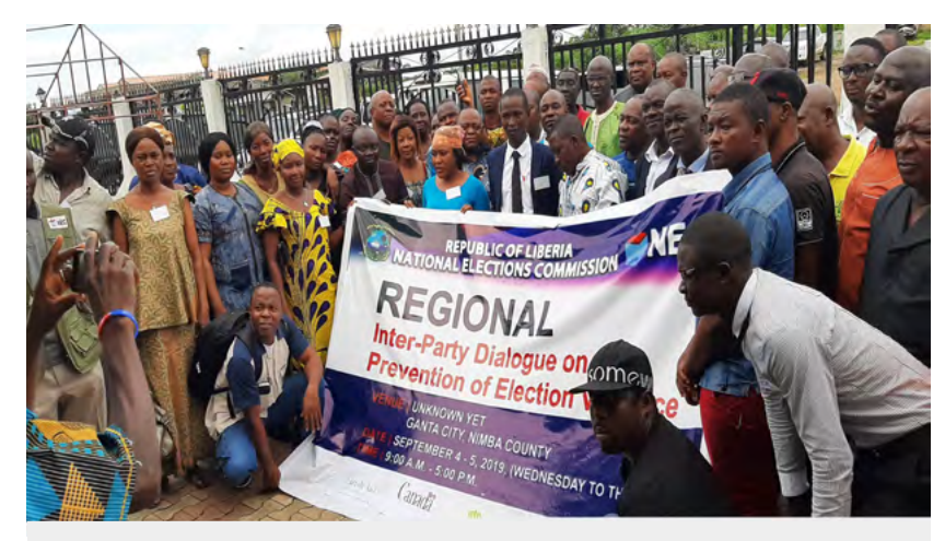
Regional Consultative Workshop held in Gbarnga, Bong County